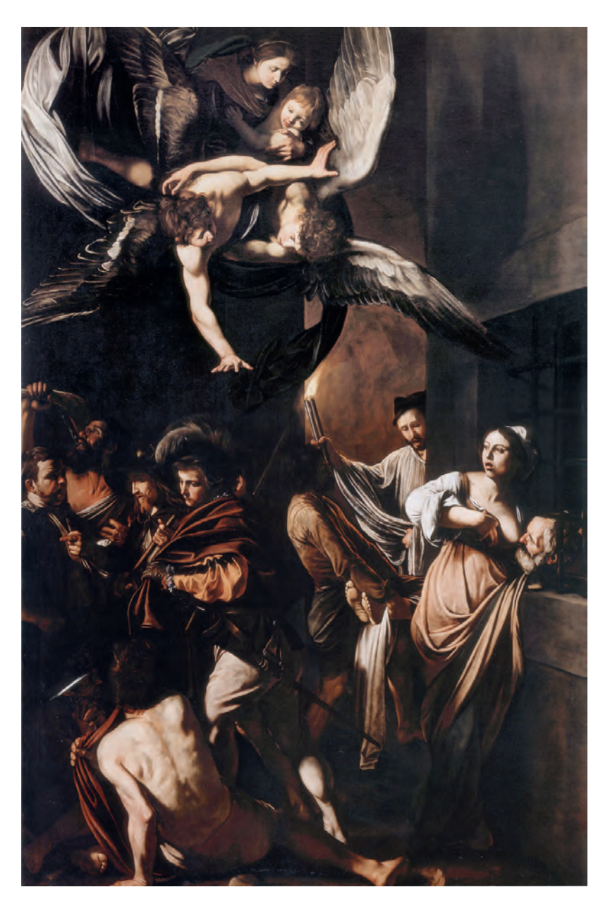
Caravaggio, The Seven Works of Mercy, 1607.